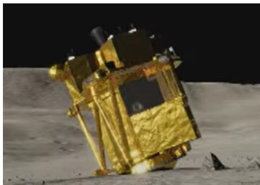
A rendering of the Smart Lander for Investigating Moon (SLIM) on the lunar surface.

The Japan Aerospace Exploration Agency (JAXA) successfully landed their Smart Lander for Investigating Moon (SLIM) on January 19, 2024. Just before touchdown, SLIM released two small lunar surface probes, LEV-1 and LEV-2.